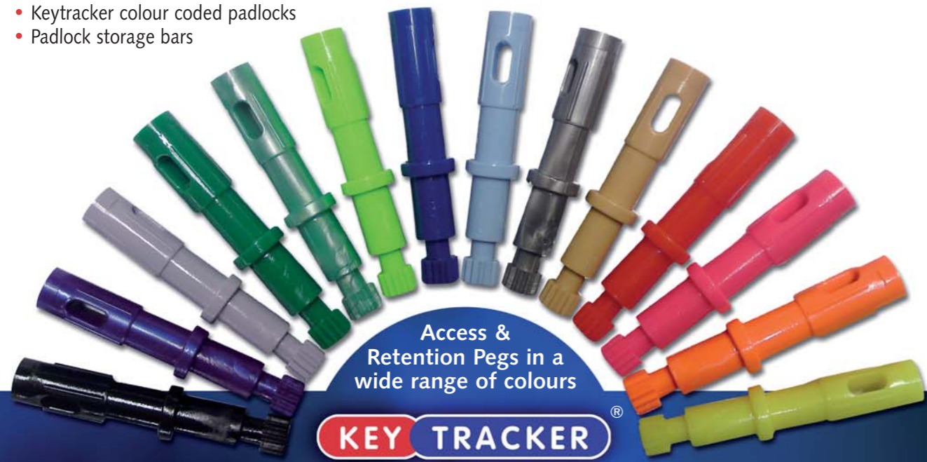
Access & Retention Pegs in a wide range of colours